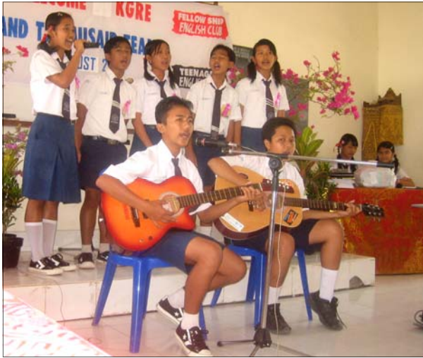
Entertaining other clubs with songs in English