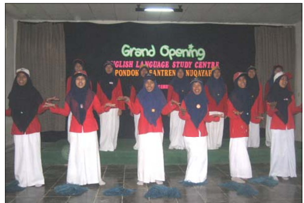
Performing traditional dance