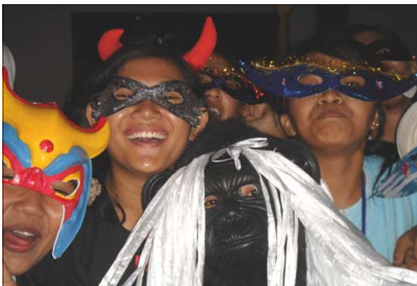
Making new friends at a camping weekend

Interests such as music, dance, drama, sport, camping, movies, debating, board games and visiting tourist attractions combine very well with language activities. These activities will vary depending on the ages and interests of club members.