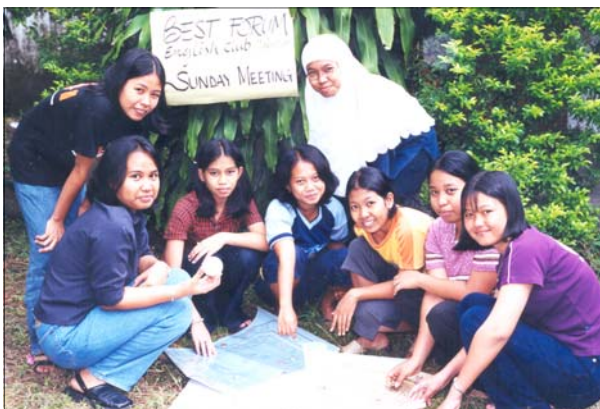
Playing board games