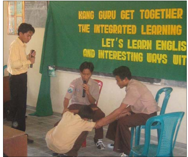
Raising awareness of an important issue through drama

Club activities can provide many opportunities to do the things you enjoy while using English.