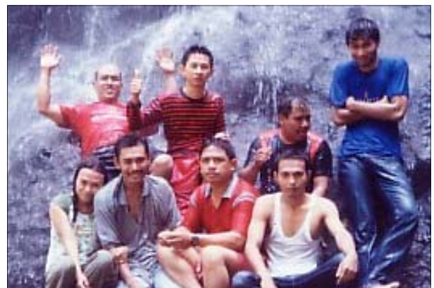
Visiting a tourist attraction